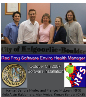
Recently installed at the City of Kalgoorlie Boulder